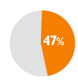
... have trouble sourcing enough qualified candidates.

be ambassadors for your brand. As such, they must understand what motivates job seekers to take action, and communicate with them in a fashion that entices and excites them to do so. An important aspect of this is knowing your culture and communicating it effectively. Cultural fit is important for attracting job seekers, but also for engagement and retention after they become employees.