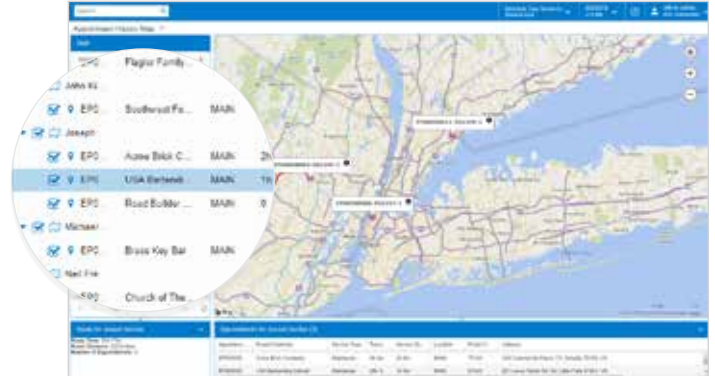
At-a-glance appointment history

Streamline processes, reduce response times and costs for your field service team resulting in increased customer satisfaction and revenue. Acumatica's Service Management provides a complete set of functionality for your field service operations.