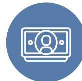
Payroll, Tax, Union Fringes, Certified Payroll Reporting