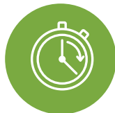
Time & Attendance Union Wage & Benefit Rates and Prevailing Wage Rates